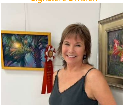
Tammy Papa "Moonlight Through the Palms"