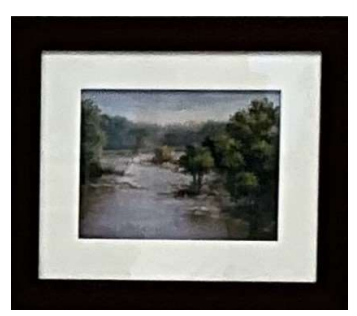
Al Leitch "Saluda in the Morning"