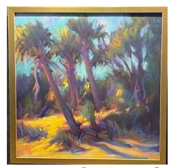
Tammy Papa "Leaning Into It"